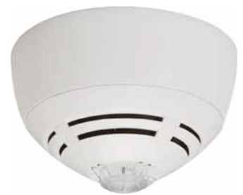
Wireless gateway with IQ8Quad detector